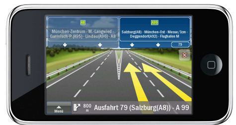
ClearTurn™ for realistic portrayal of motorway exits.

Falk has previously combined a Travel Guide and navigation in its mobile navigation systems. This tradition is now also continuing with the iPhone. The navigation solution from Falk is the first to feature a compatible Travel Guide. The Falk Guides, which have been on the market since the start of October 2009, can be cleverly